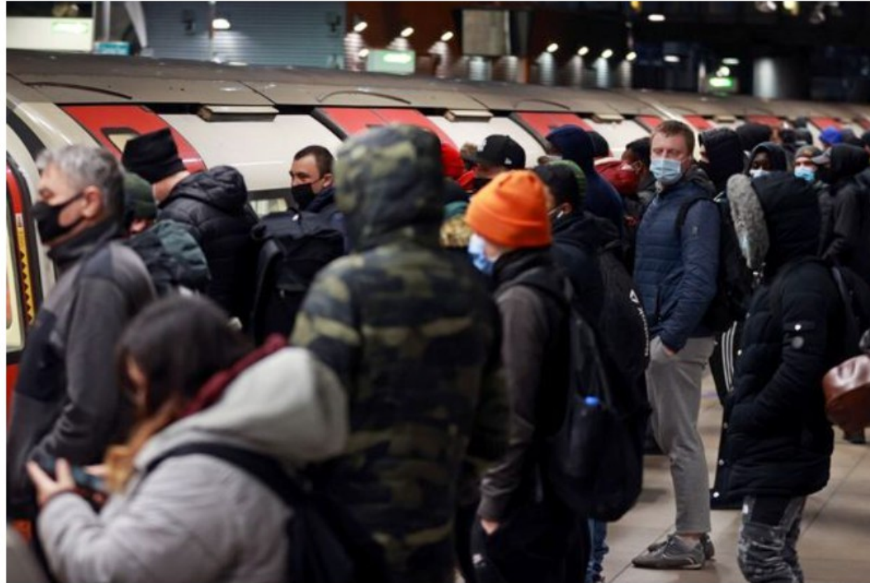
Commuters wait for the train at rush hour at Canning Town underground station in London, January 18, 2021